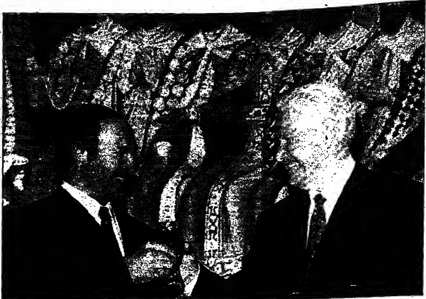
Russian President Boris Yeltsin toasts his Belarusian counterpart Alexander Lukashenko in the Kremlin yesterday.

draft, was initiated by the presidents and sent for six weeks of reworking and public discussion. Liberal critics feared the original draft could harm Russia's economy and make Lukashenko, who once professed respect for Adolf Hitler, a key player in Moscow politics. Above all, liberals feared Lukashenko could win jurisdiction over decisions affecting Russia under a Supreme Council set to oversee the Russia-Belarus union under the draft. The new document "is much more thought-out than before, thanks to intelligent people," Russian First Deputy Prime Minister Boris Nemtsov said. Yeltsin said the treaty gave citizens of the two countries freedom of movement and rights of residency, property ownership and participation in local elections in both Belarus and Russia. "It is entirely in line with those norms which have existed for a long time in the countries of the European Union," Yeltsin said.